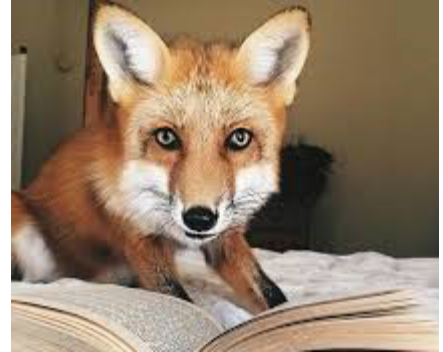
Ideal New Committee Member in Action

If you could fit in with the foxy committee members shown above the mission statement and think you