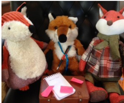
Strategic Planning Steering Committee in Action