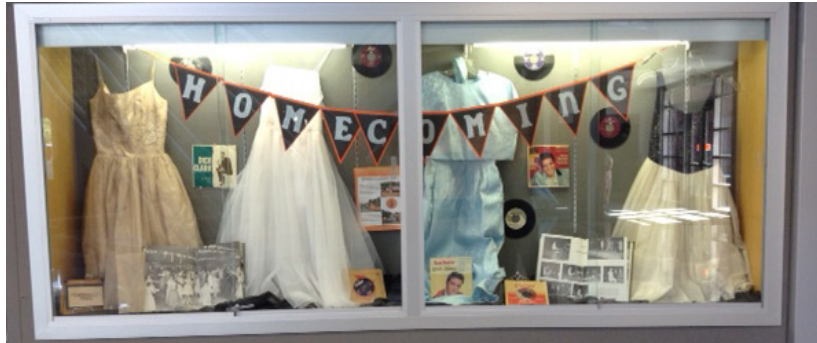
The current SHSAA display at the high school celebrates Homecoming. The display has a variety of formal dresses and 45 rpm records.